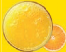
Orange Juice £1.50

Toast x2 (V) (VE) .....£2.00 with Butter/Flora Add Jam for 50p