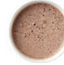
Hot Chocolate £3.00