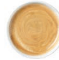
Flat White £2.40