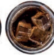
Diet Coke £1.50