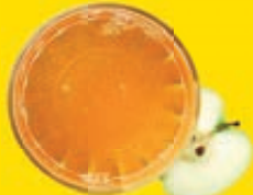
Apple Juice £1.50