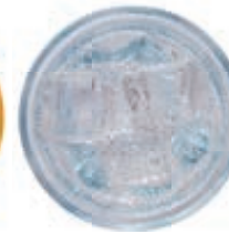
Sprite Zero £1.50