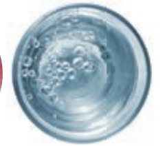
Bottled Water £1.50