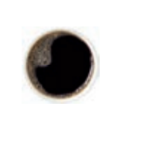
Double Espresso £2.40